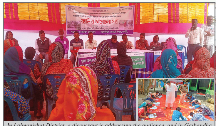
In Lalmonirhat District, a discussant is addressing the audience, and in Gaibandha District, community children are taking part in art competition (Inset). 6KS Foundation observed National Disaster Preparedness

SKS Foundation observed National Disaster Preparedness Day (NDPD) on 10 March 2025, reinforcing community resilience against disasters. In line with this year's theme-"Dorjoge Purbavash Prostoti, Bachay Pran Khoykhoti" (Disaster Forecast & Preparedness Save Lives & Reduce Losses), SKS organized a range of grassroots-based activities across its working areas. (See page 3)